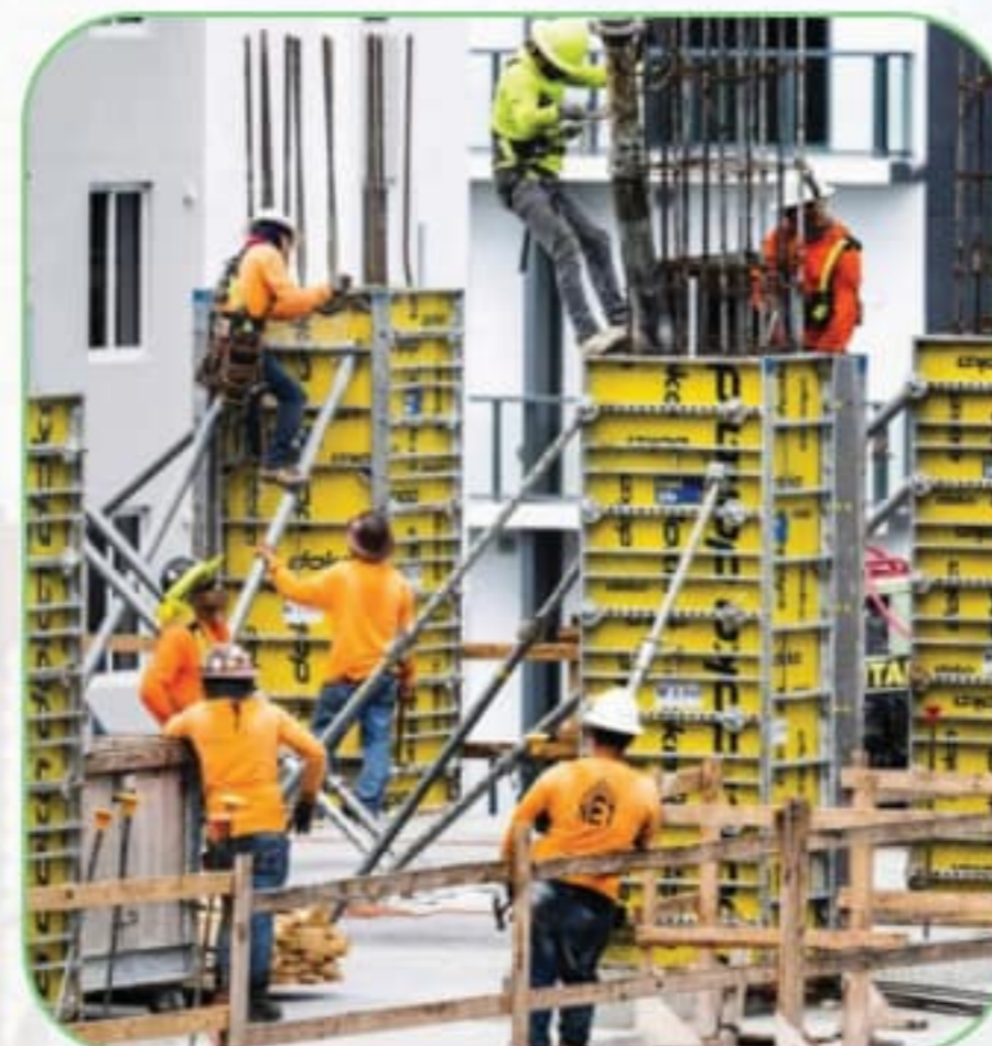
CONSTRUCTION & INDUSTRIAL JOBS