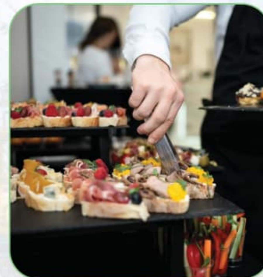
HOSPITALITY & CATERING JOBS