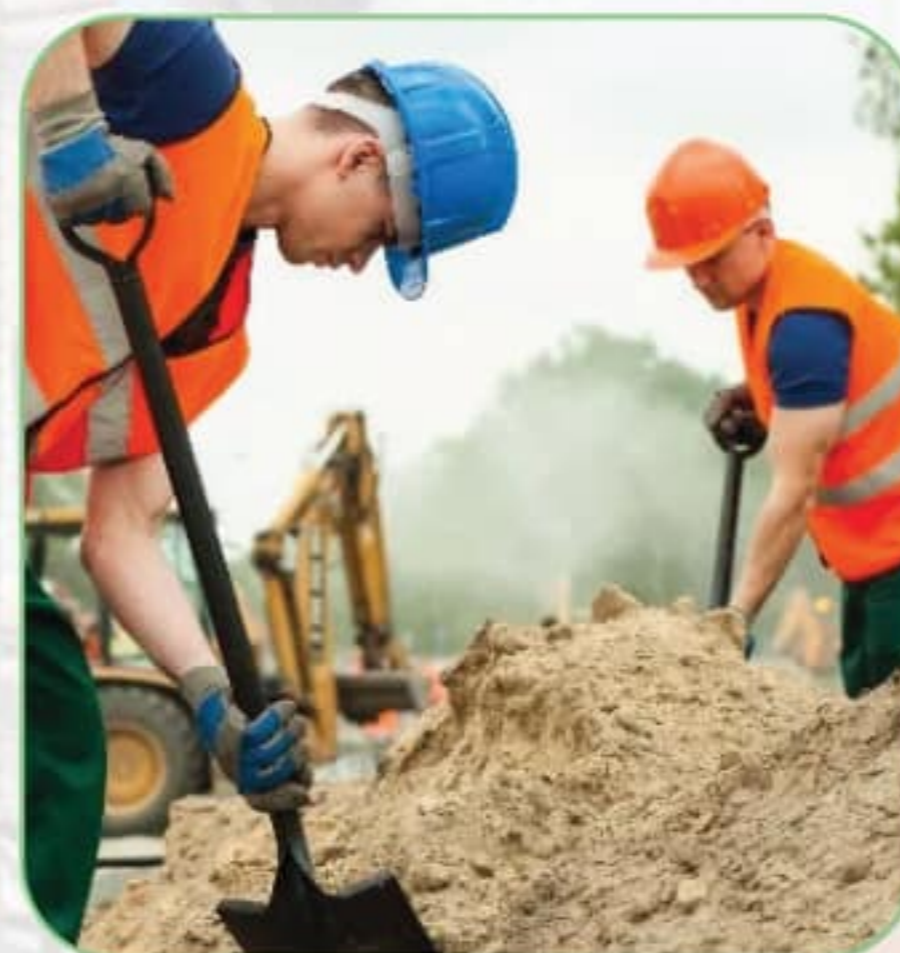
GENERAL LABOR & HELPER JOBS