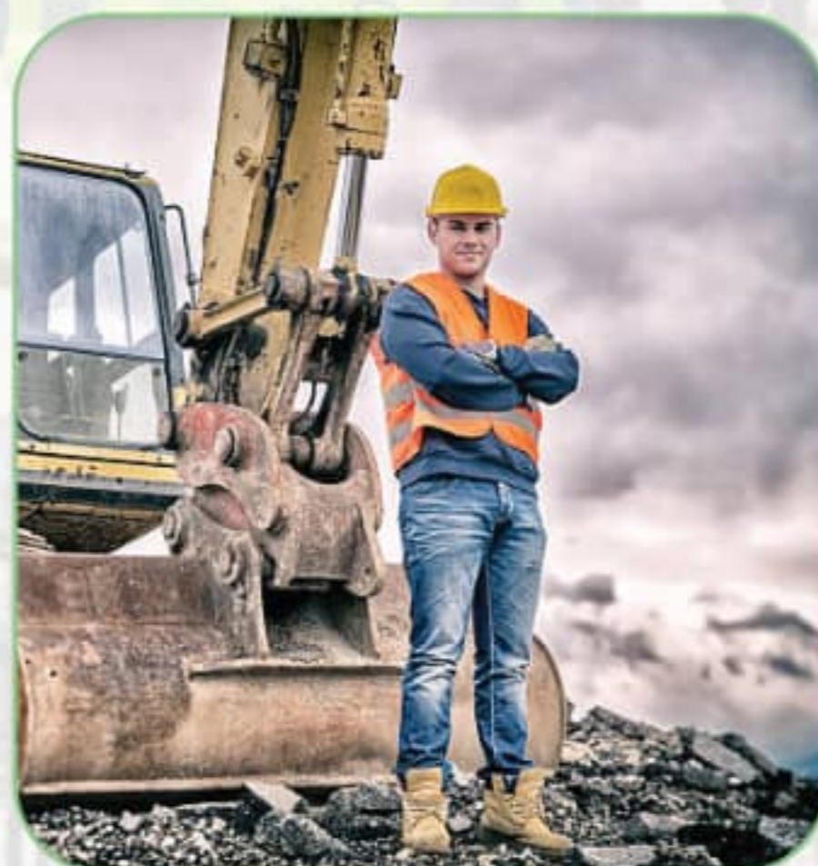
HEAVY EQUIPMENT OPERATORS & DRIVERS