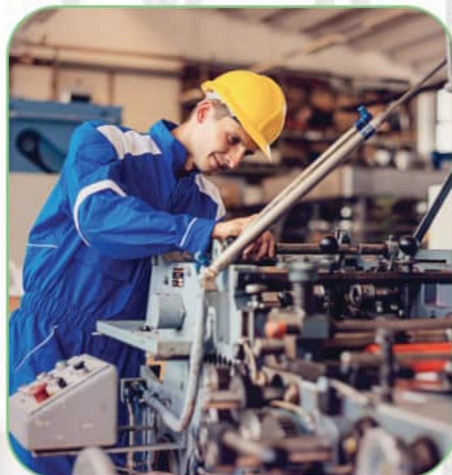
ENGINEERING & TECHNICAL JOBS