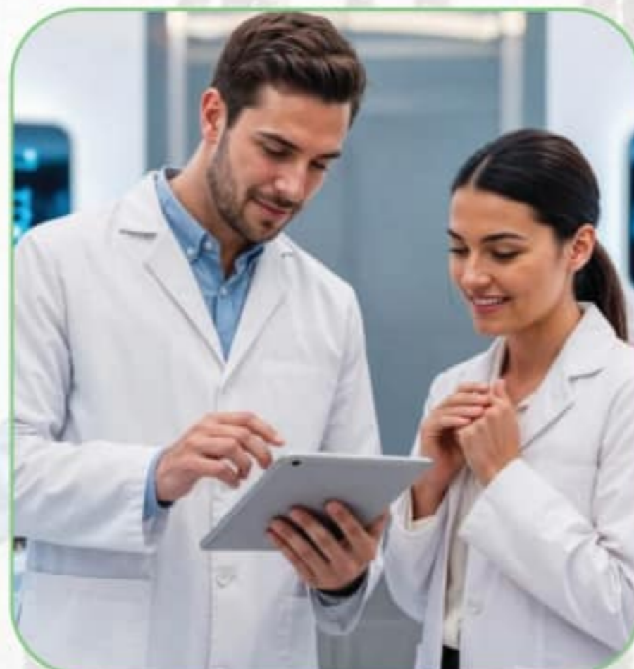
HEALTHCARE & PHARMACY JOBS